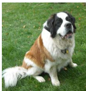
Harley was Hanging on the Hill

This summer and autumn guests at Windy Dog Hill reported a strange phenomenon after their Vermont visits. In email after email, expressed in a number of different ways, we heard: Our pup was so exhausted he/she/they “ slept all the way home!!! ”