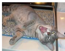
PiP (as in Pip-squeak)

This July a new boy arrived on the hill. PiP sauntered out of the woods into our life. He has settled in nicely and