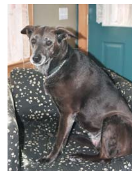
Franny Settled in While the Family Skied

WE ARE CONSIDERING A SURCHARGE IF YOU DON'T BRING YOUR PET. (LOL)