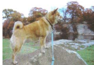
Destiny Visited Lake Champlain

Sugaring comes with mud season, and guest Mary made a return visit in late March before the mud hit to do the open house weekend at Vermont sugar houses. Maple doughnuts, sugar on snow, and sweet-steam-cleared-sinuses as sap boiled to syrup at six local sugar shacks! (30 gallons of sap = 1 gallon of syrup.)