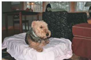
Guinness Waits for Mom and Dad

We had a great first winter of inn keeping at Windy Dog Hill and we owe our many guests a whole lot of thanks. From Christmas to the end of March we were booked almost every weekend, and a good number of weekdays. For folks and pups we had to turn away due to prior bookings, we'd love to host you in the future!